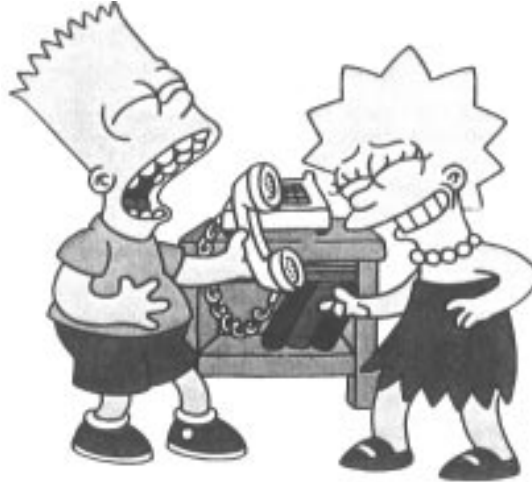
The Simpsons TM & © are owned by Twentieth Century Fox Film Corporation. All Rights Reserved