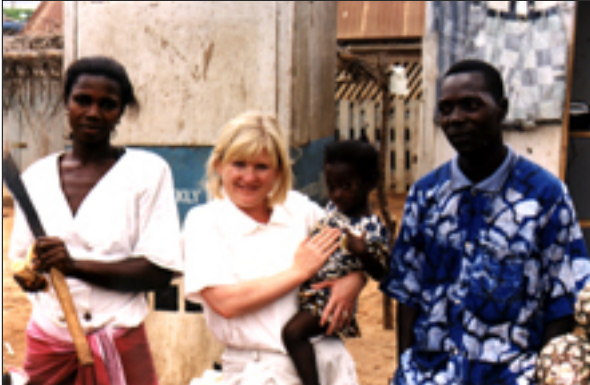
Local sugar cane merchants and their daughter in my arms. Sweet.